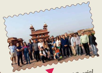
Visit of participants of 3rd Special Course for Diplomats from Syria and 4th Special Course for Iraq to Fatehpur Sikri