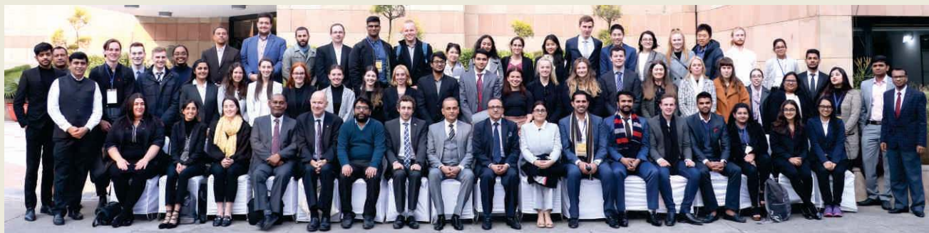
The faculty & students from Australian Universities (Deakin, La Trobe, Monash, Murdoch, RMIT, New England, New South Wales & Wollongong) and O.P. Jindal Global University, Gurgaon visited SSIFS on 10 January 2020.