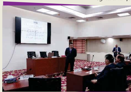
Country presentation by Iraqi diplomats