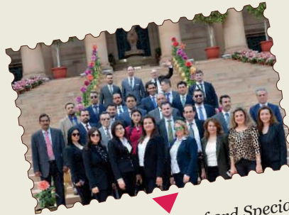
Visit of participants of 3rd Special Course for Diplomats from Syria and 4th Special Course for Iraq to Rashtrapati Bhavan