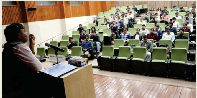
Induction Training Programme for Direct Recruit ASOs in progress