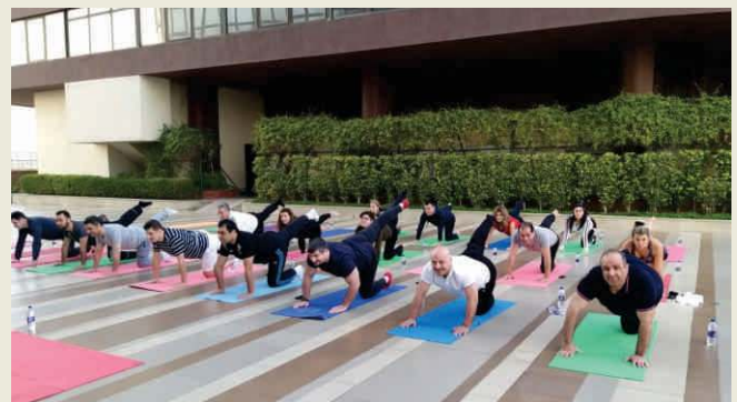
Diplomats from Syria and Iraq participated in Yoga Session