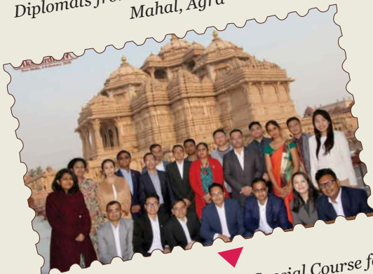
Visit of participants of 1st Special Course for Diplomats from BIMSTEC Countries to Akshardham, New Delhi