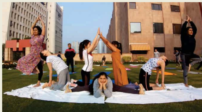
Diplomats from BIMSTEC Countries participated in Yoga Session