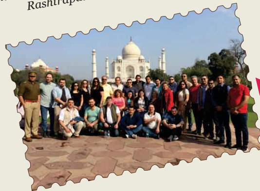
Visit of participants of 3rd Special Course for Diplomats from Syria and 4th Special Course for Iraq to Taj Mahal, Agra