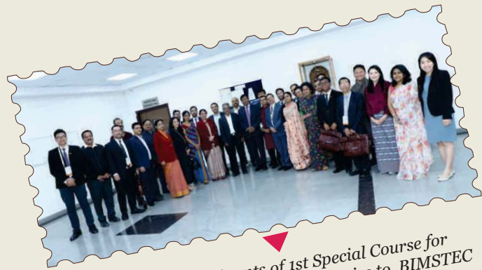
Visit of participants of 1st Special Course for Diplomats from BIMSTEC Countries to BIMSTEC Centre for Weather and Climate, Noida