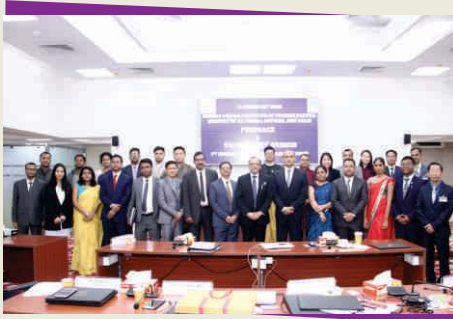
Valedictory session of 1st Special Course for Diplomats from BIMSTEC Countries