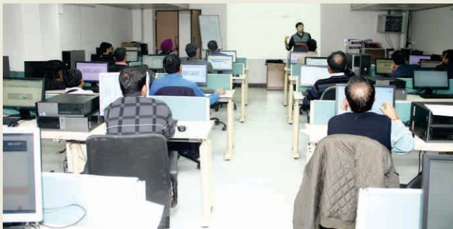
Participants of IVFRT undergoing hands-on training