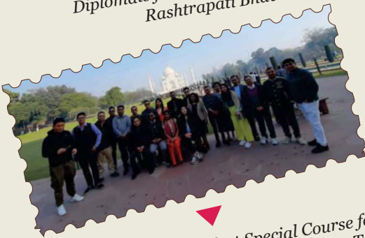
Visit of participants of 1st Special Course for Diplomats from BIMSTEC Countries to Taj Mahal, Agra