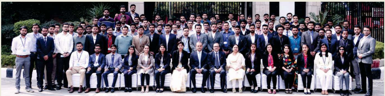
Induction Training Programme for 92 new Direct Recruit ASOs was organised at SSIFS.