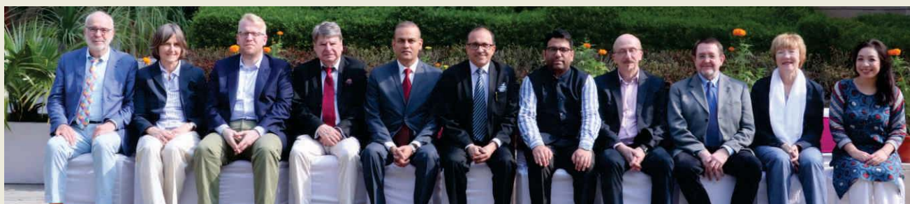
Professors from German Universities visited SSIFS on 2 March 2020 and interacted with Dean (SSIFS).