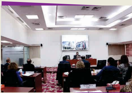
Country presentation by Syrian diplomats