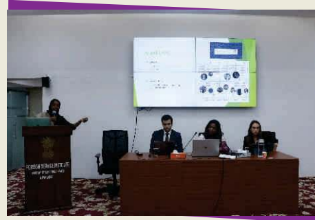
Country presentation by participants of 2nd Annual D&ISA Fellowship Programme