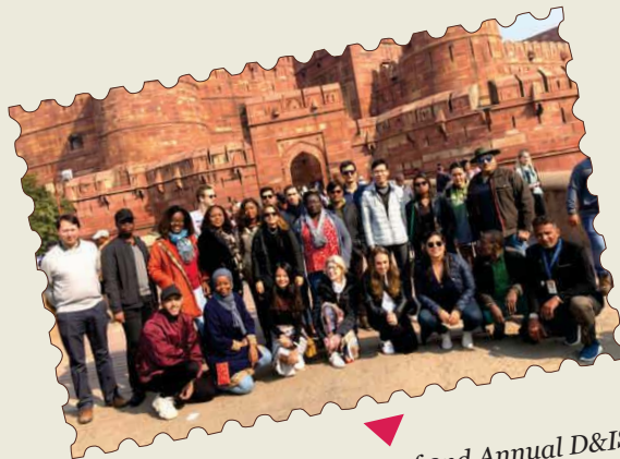
Visit of participants of 2nd Annual D&ISA Fellowship Programme to Agra Fort