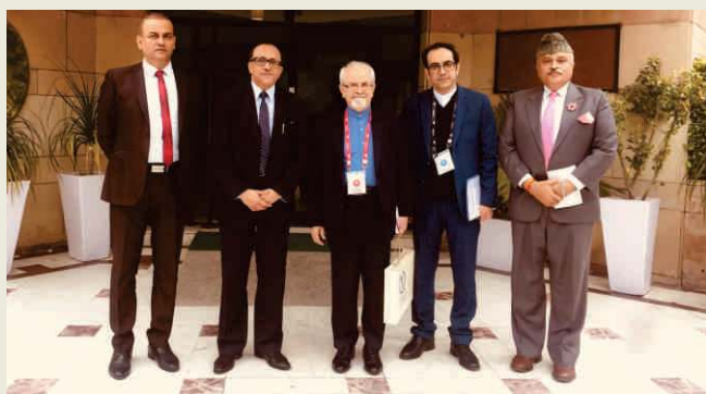
Dr. Seyed Kazem Sajjadpour, Deputy Foreign Minister of Iran visited SSIFS on 16 January 2020 to discuss training of Iranian diplomats at SSIFS.