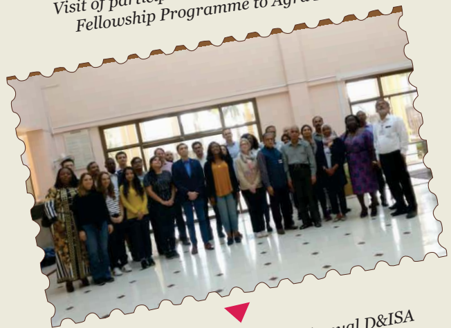
Visit of participants of 2nd Annual D&ISA Fellowship Programme to Department of Atomic Energy, Mumbai