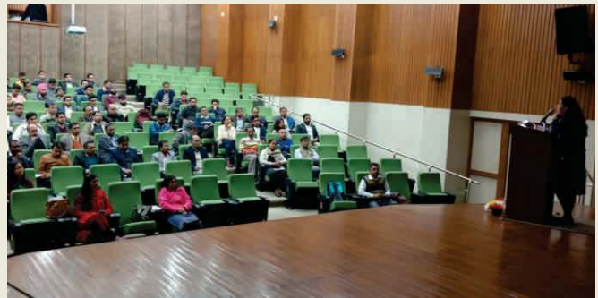
IVFRT Session in progress