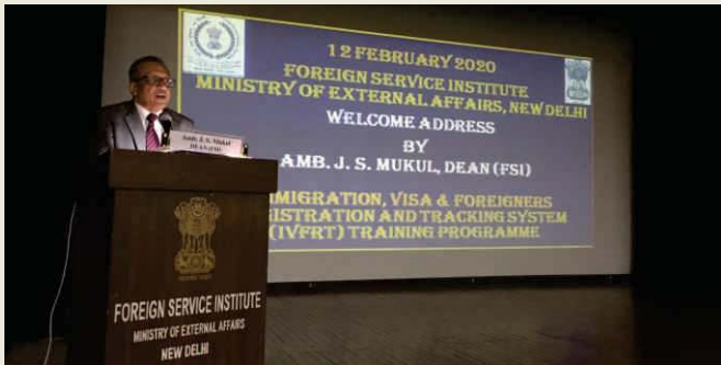
Dean (SSIFS) welcoming participants of IVFRT Training