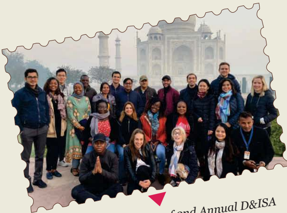
Visit of participants of 2nd Annual D&ISA Fellowship Programme to Taj Mahal, Agra