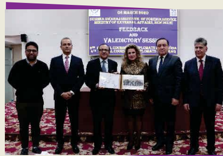
Valedictory session of 3rd Special Course for Diplomats from Syria and 4th Special Course for Diplomats from Iraq.