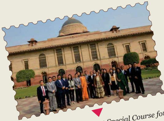
Visit of participants of 1st Special Course for Diplomats from BIMSTEC Countries to Rashtrapati Bhavan