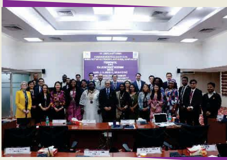
Valedictory session of 2nd Annual D&ISA Fellowship Programme