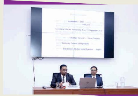
Country presentation by BIMSTEC Secretariat diplomats