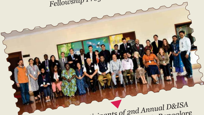
Visit of participants of 2nd Annual D&ISA Fellowship Programme to ISRO, Bangalore