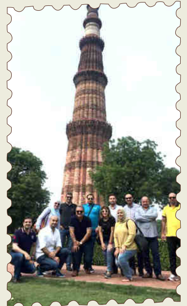
Visit to Qutub Minar by Iraqi diplomats