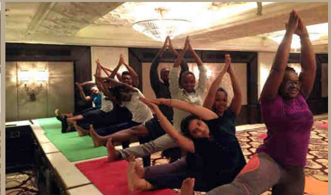
Diplomats from CARICOM countries participated in Yoga Session