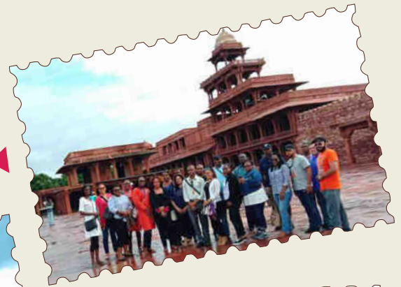
Visit to Fatehpur Sikri by CARICOM diplomats