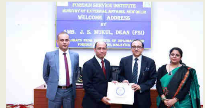
7 Malaysian diplomats, pursuing Diploma in Diplomacy from the Institute of Diplomacy and Foreign Relations (IDFR), accompanied by their Director and Assistant Director visited FSI on 29 July 2019.