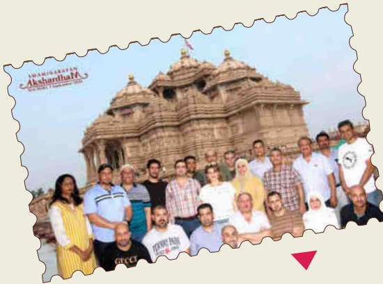
Visit to Akshardham by Iraqi diplomats