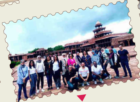
Visit to Fatehpur Sikri by League of Arab State diplomats