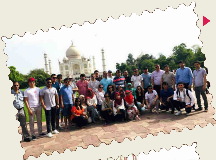
Visit to Taj Mahal by Central Asian and Maldivian diplomats