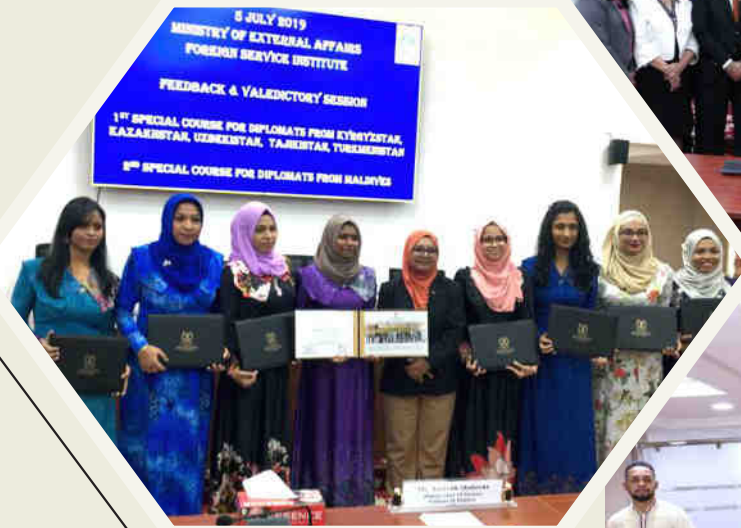
Valedictory Function for Maldivian diplomats