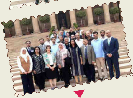
Visit to Rashtrapati Bhawan by Iraqi diplomats