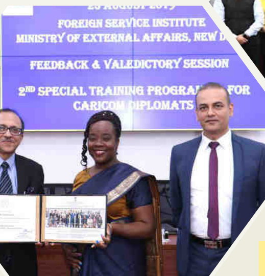
Valedictory function for CARICOM diplomats.