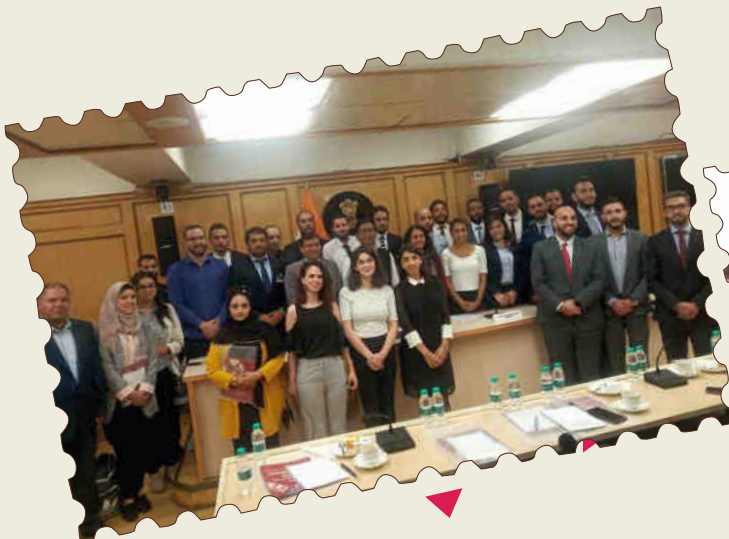
Visit to Election Commission by Palestinian and Libyan diplomats