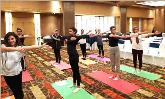
Diplomats from Libya and Palestine participated in Yoga Session