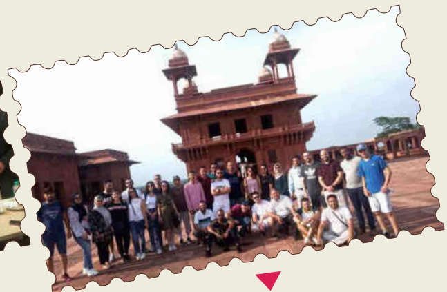
Visit to Fatehpur Sikri by Palestinian & Libyan diplomats