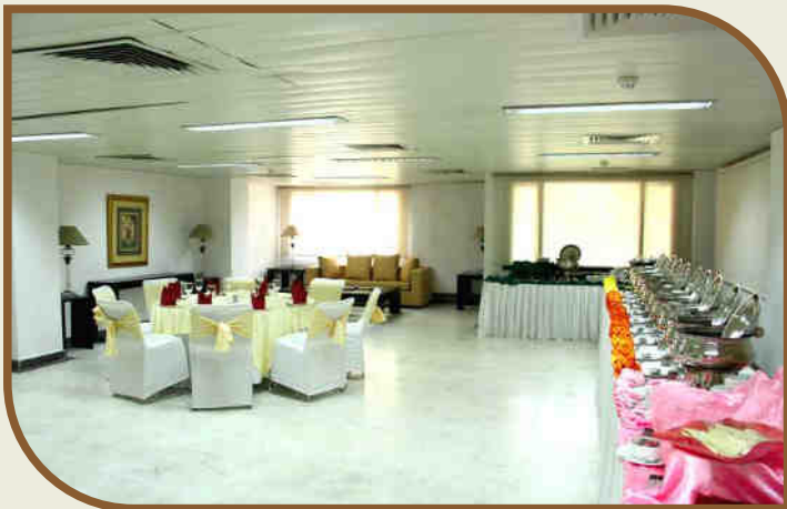
Executive Dining Room (EDR)