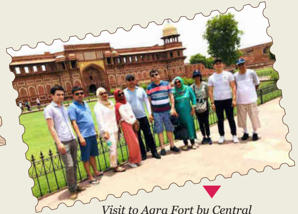
Visit to Agra Fort by Central Asian and Maldivian diplomats