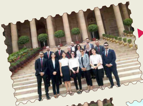
Visit to Rashtrapati Bhawan by Palestinian diplomats