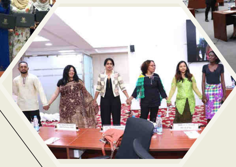
Country presentation by CARICOM diplomats