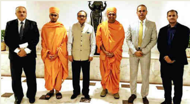
Sadhu Ganmuni Das Swami Ji of Akshardham visited FSI on 15 July. Foreign diplomats attending training programmes at FSI visit Akshardham on study tour.