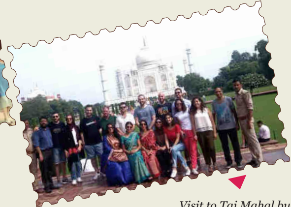
Visit to Taj Mahal by Palestinian diplomats