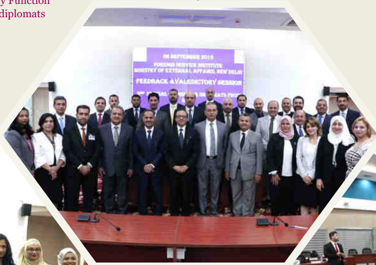
Valedictory Function for Iraqi diplomats