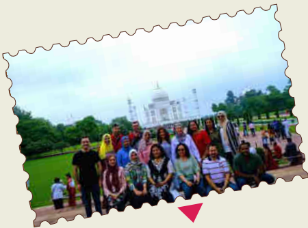
Visit to Taj Mahal by League of Arab State diplomats