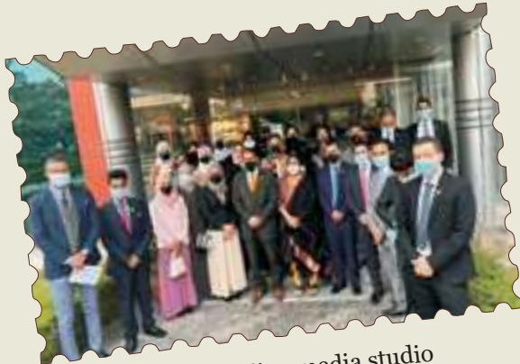
Visit to Indian media studio