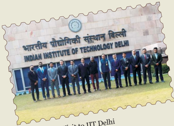
Visit to IIT Delhi