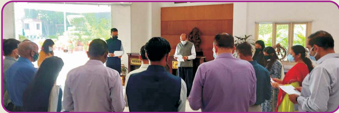
Dean (SSIFS) administered the Rashtriya Ekta Diwas pledge on 31 October 2021