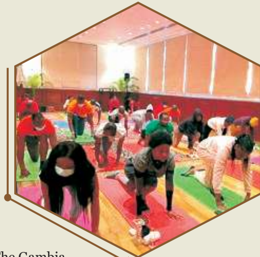
Diplomats from The Gambia participated in the Yoga Session