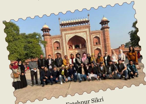
Visit to Fatehpur Sikri