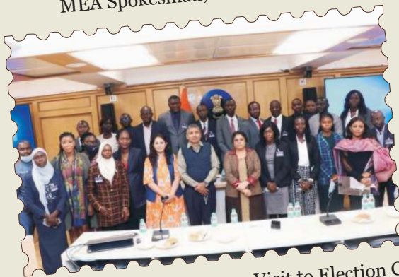
Visit to Election Commission of India (ECI)