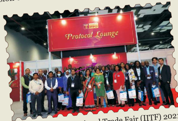
Visit to India International Trade Fair (IITF) 2021