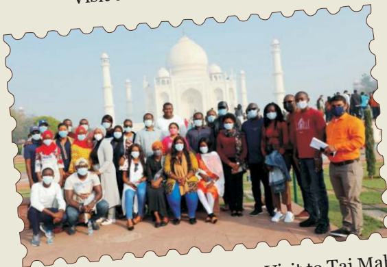
Visit to Taj Mahal and Fatehpur Sikri