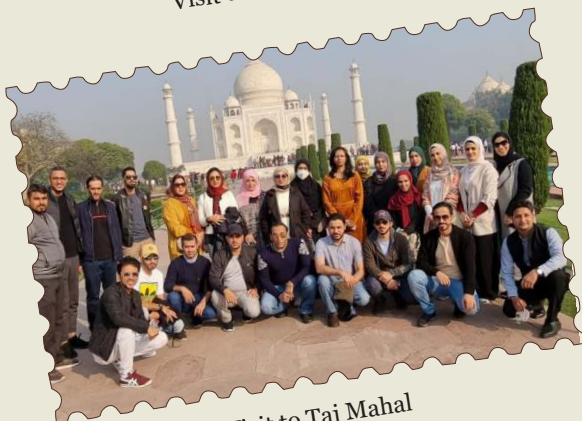
Visit to Taj Mahal