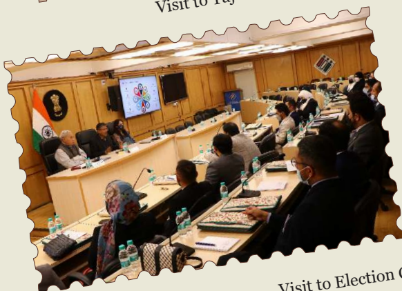
Visit to Election Commission of India