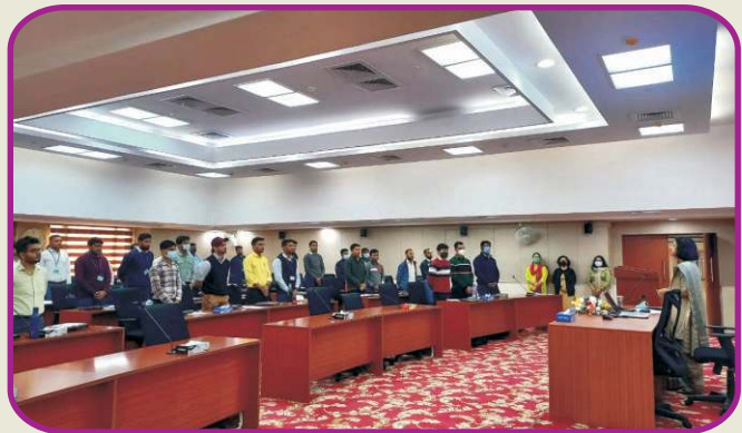
Joint Secretary (SSIFS) administered the Constitution Day pledge on 26 November 2021 to Personal Assistants and Stenographers during their Induction Training Programme