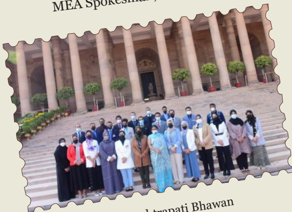
Visit to Rashtrapati Bhawan