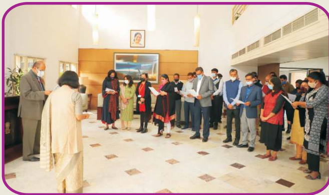
Dean (SSIFS) administered the Constitution Day pledge on 26 November 2021