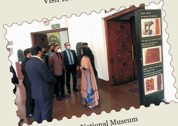
Visit to the National Museum