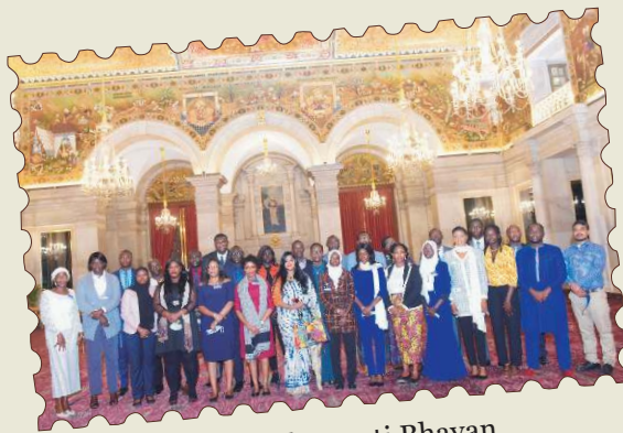
Visit to Rashtrapati Bhavan