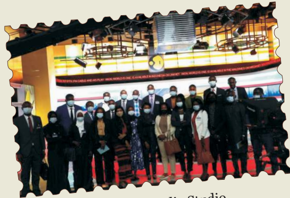
Visit to Media Studio